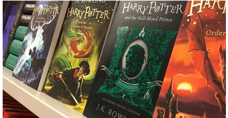
Harry Potter books on display.