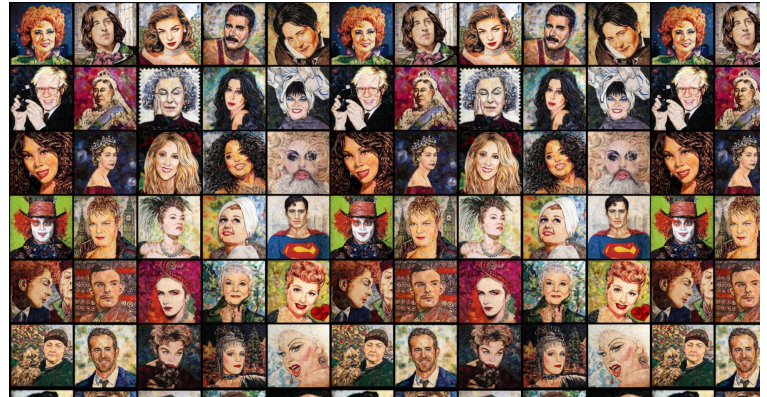
Dames, Divas and Icons exhibition.