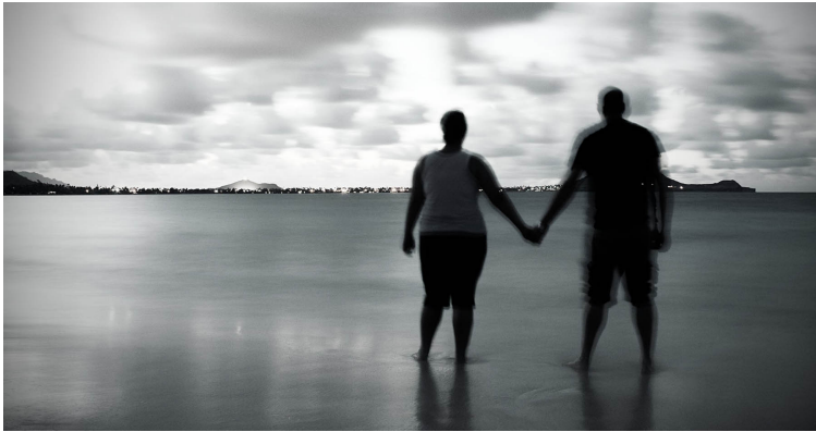
Hold Hands by Brian Talbot. Used under a CC BY-ND 2.0 license.