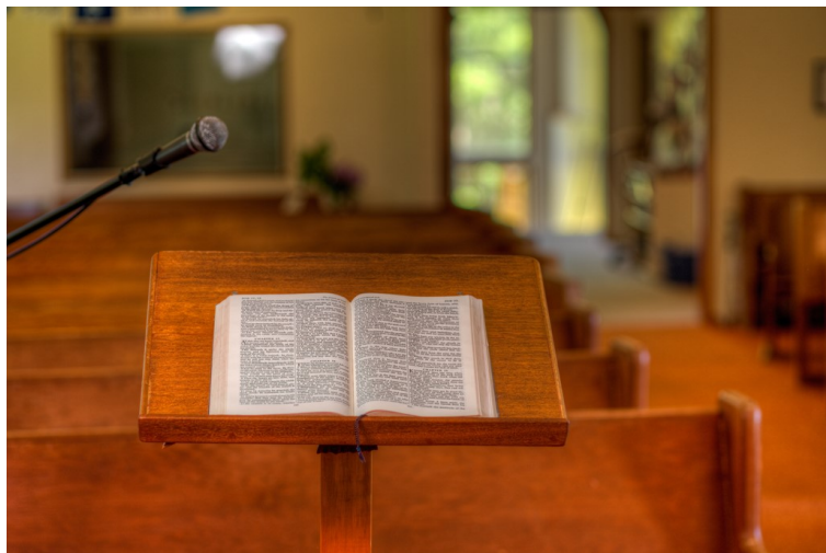
Bible on a lectern at St Columba, Port Hardy.