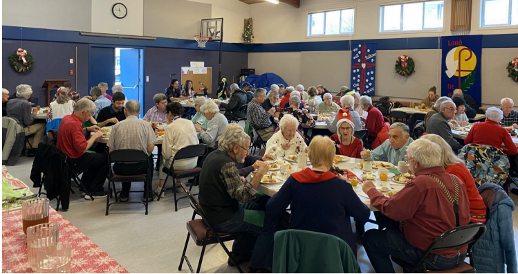
Members of the local community gather in the St Andrew church hall for Christmas dinner.