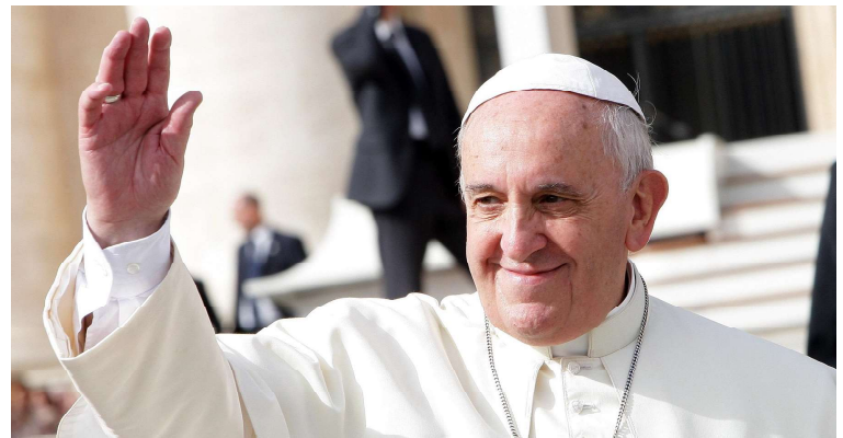
Pope Francis.