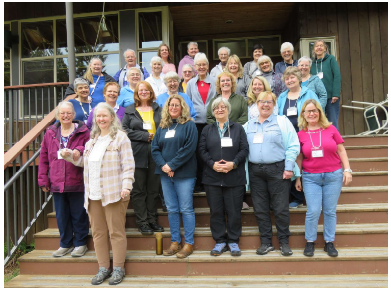
Women's Spring Retreat 2024 attendees with Archbishop Linda Nicholls (centre).