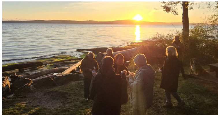
St Philip's, Cedar (Nanaimo) sunrise service with Cedar United Church at Blue Heron Park.