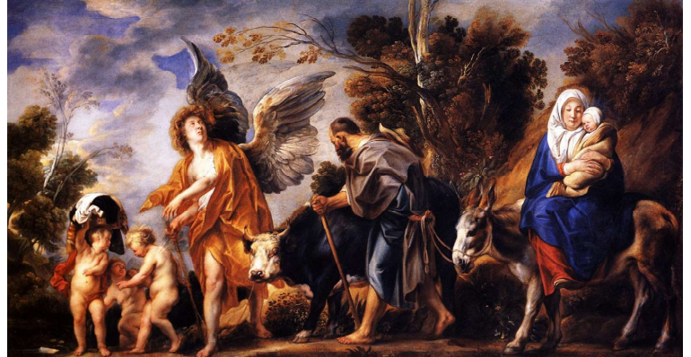
The Flight into Egypt by Jacob Jordaens.