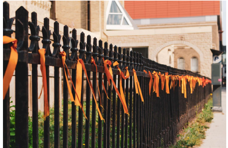
Orange ribbons tied to a wrought iron fence outside Saint Mary's Cathedral, Winnipeg, Manitoba.

RENEWED HEARTS RENEWED SPIRITS RENEWED PEOPLE