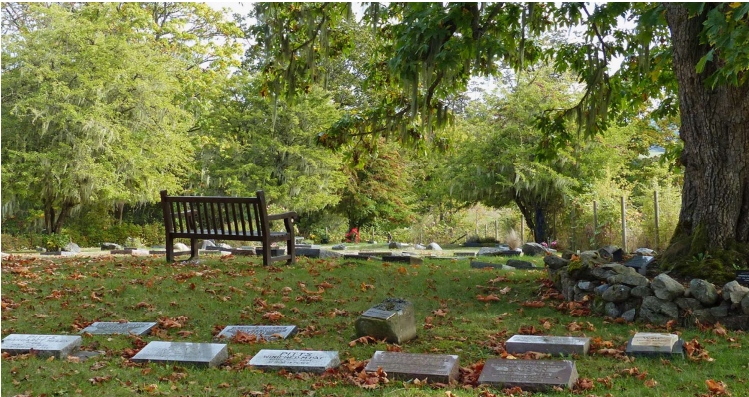
The grounds of St Stephen's Anglican Church.