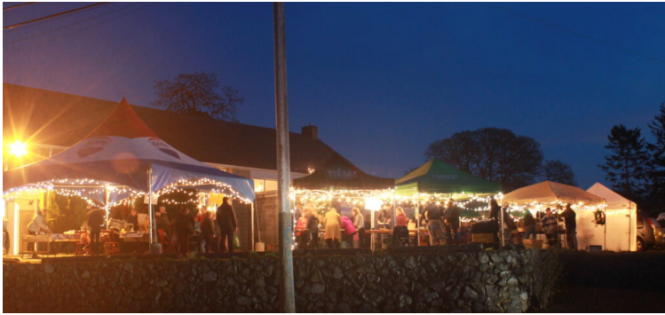
Star Sunday crafting fair at St. Barnabas, Victoria.

On Sunday, Dec. 7, 2025, St. Barnabas Anglican Church in Victoria hosted the 17th annual Star Sunday, a beloved community crafting fair marking the Second Sunday of Advent. Families and friends are invited to enjoy hands-on craft stations where children and adults can make Christmas decorations and gifts from natural materials, including beeswax candles, wreaths, cards and beads.