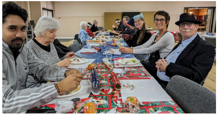
Eating lunch at Church of the Advent's Christmas Day Home Alone lunch.