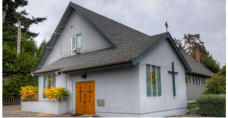
St. Philip Anglican Church in Oak Bay.