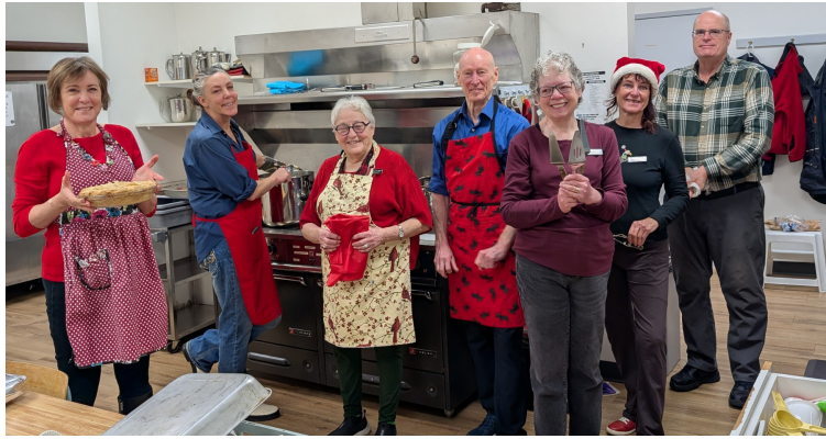
Some of the volunteers who helped make Church of the Advent's 2025 Christmas Day lunch possible.

In 2023, the first “Home Alone” lunch saw around 20 guests and 10 parishioners and volunteers eating, mingling and having fun together. In 2024, those numbers doubled and in 2025 the lunch catered for 60 people, predominantly from the West Shore area of Greater Victoria.