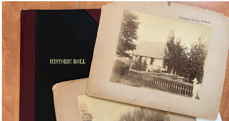
St. Stephens, Saanich, ca.1880s.