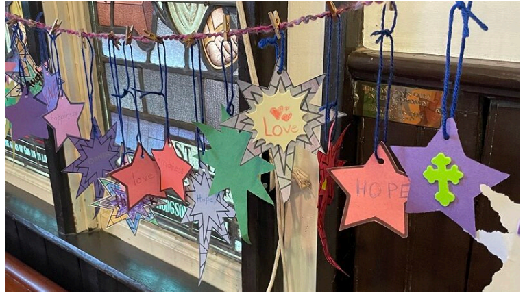
Fantastic Friday participants at St. Luke wrote the gifts they are bringing to Jesus this year on stars.

We celebrated Epiphany at St. Luke this year with the radio play, “The Fourth Wiseman” at our 10 am Sunday service at the beginning of January. This play had us thinking about the true gifts of Epiphany. The theme at the January Fantastic Friday was also Epiphany and we wrote the gifts we were bringing to Jesus on stars and hung those stars in the church.