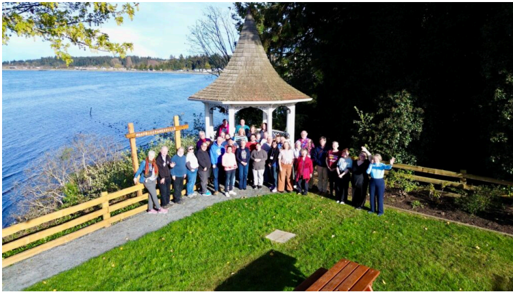
Clergy of the diocese at the 2026 clergy conference in Parksville.