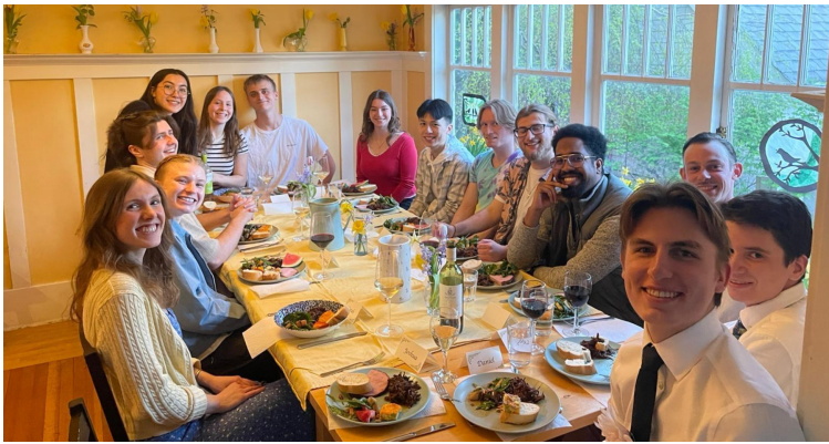
Attendees at a Sanctum Easter dinner.