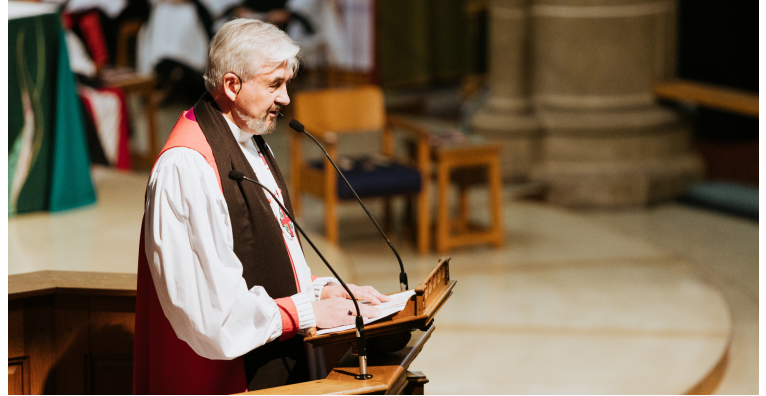
Archbishop Shane Parker delivers a sermon at Christ Church Cathedral in November 2025.