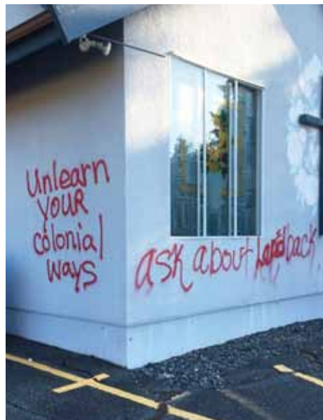
Some of the messages spray-painted in red and orange on St. Philip, Oak Bay.

As I reflected on my feelings throughout the day, I realized that the depth of my discomfort, pales into insignificance compared to the pain and tragedy experienced by parents whose children were forcibly removed from their families, in some cases never to be seen again. Nothing I or our community experienced on Monday morning, or over the following days, compares to the horrifying events in our history that have given rise to the level of pain and anger expressed in paint on the exterior of our church building.