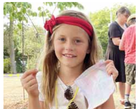
A camper with her craft project.