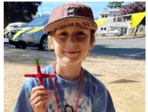
A camper with his God's eye.