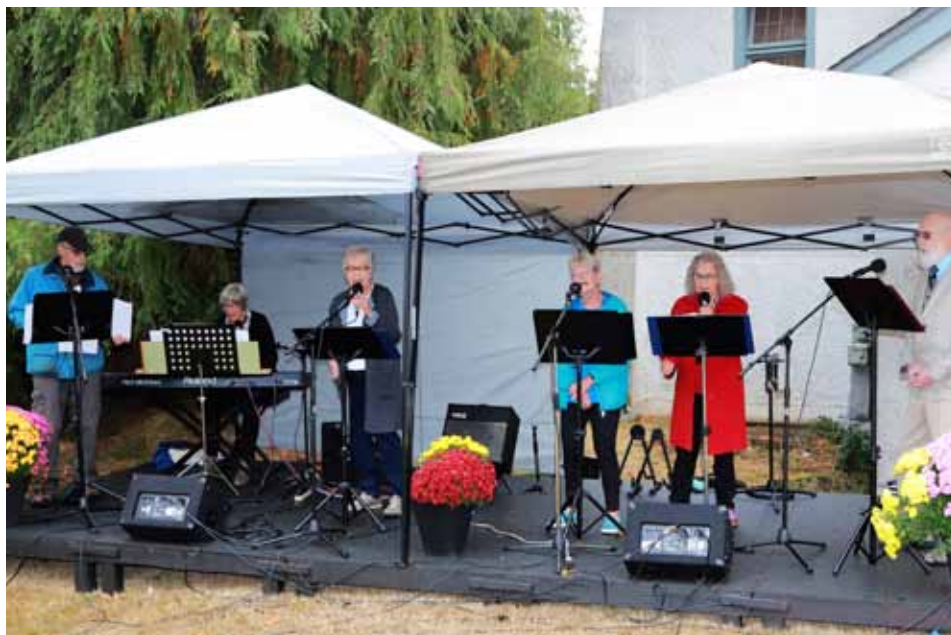
The Praise Group leading the singing at the anniversary service.