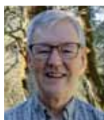
St Peter, Quamichan