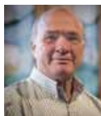
St Mary Magdalene, Mayne Island