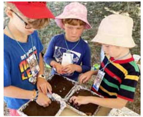
Three campers working on their miniature campgrounds.