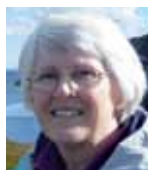
St Michael and All Angels, Chemainus