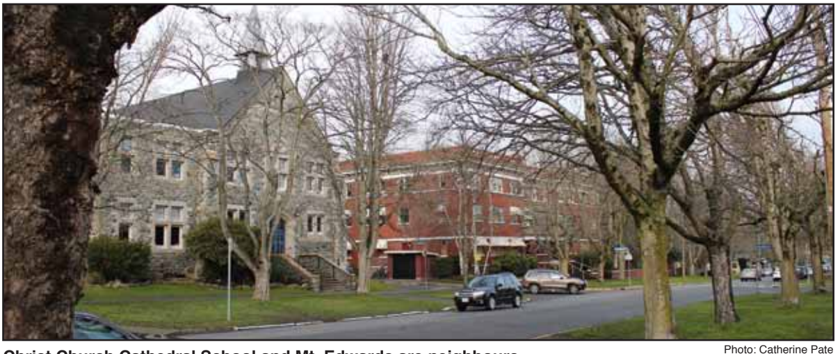
Christ Church Cathedral School and Mt. Edwards are neighbours

Some of the strongest opposition to the original plan came from parents of children attending Christ Church Cathedral